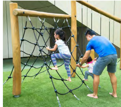
Slide Platform with Steel Slide, Cargo Net climb and Toddler Stairs