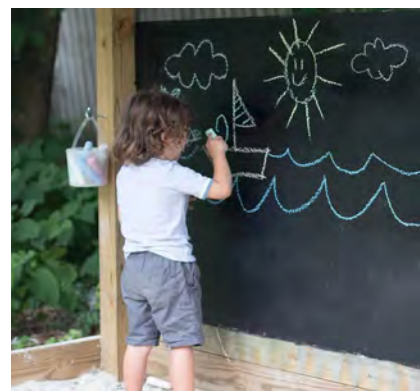
Repurpose Existing Cricket Stumps Wall as Chalkboard