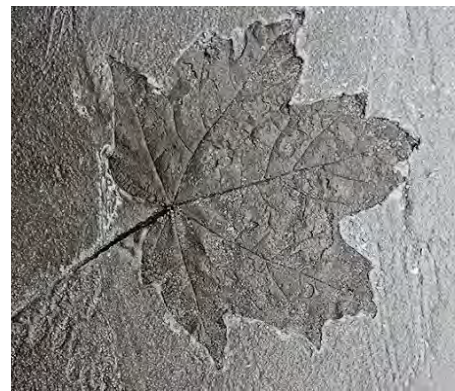
Vine Leaf Imprints in Concrete

Note: Images shown on these plans are indicative only. The final materials and product selected will be subject to Council's procurement processes.