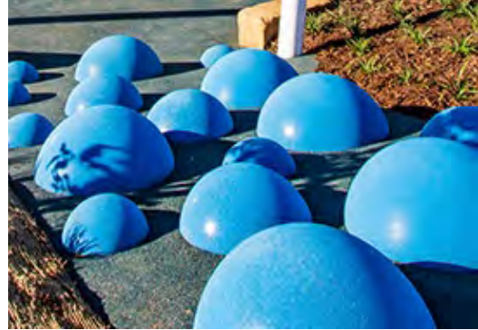
Small group of Softfall Bubbles